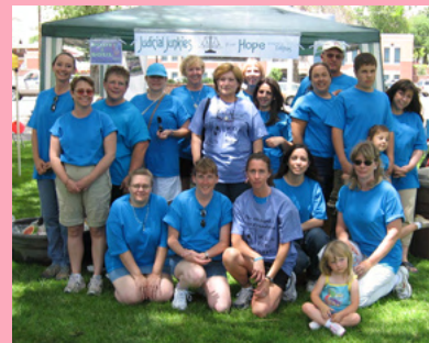
TEAM MATES FROM: District Attorney's Office Court Clerks & Probation